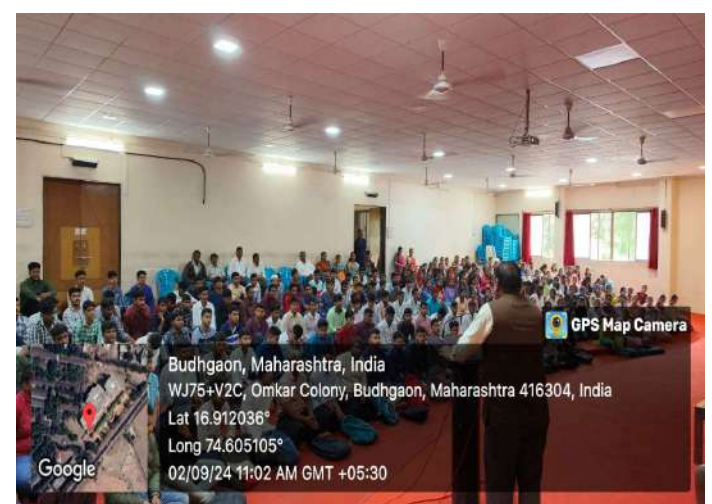
Introduction of Faculty Members