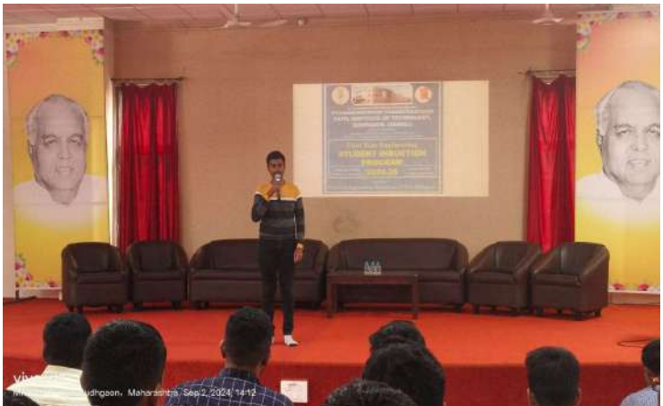
Students performing activities