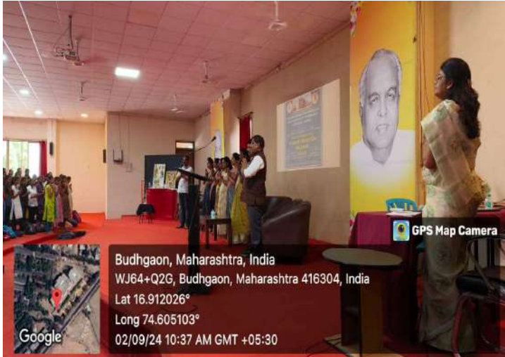
Inauguration of the event with prayer