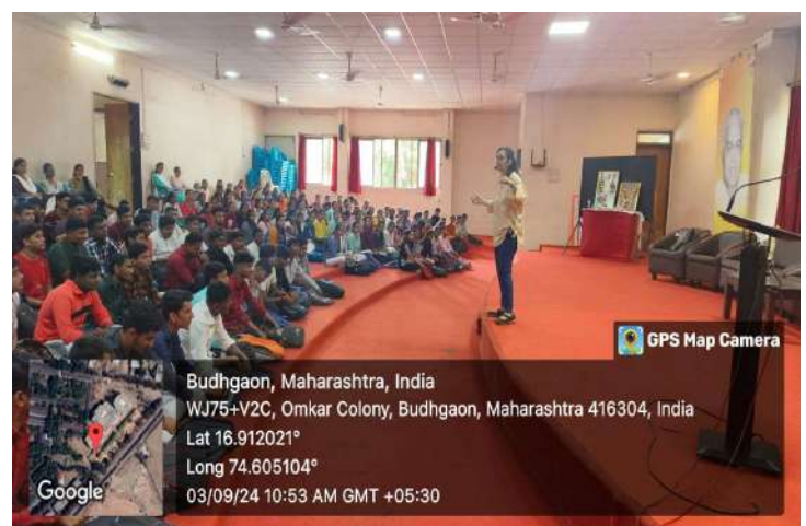
Guest Speaker during presentation