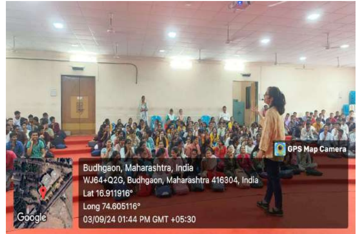
Interaction with students