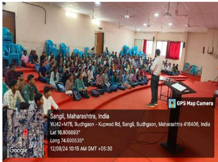
Guest Speaker during presentation