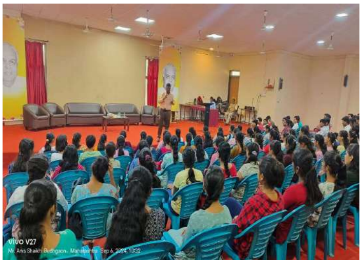
Guest Speaker during presentation