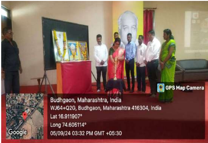
Lamp Lightening Ceremony