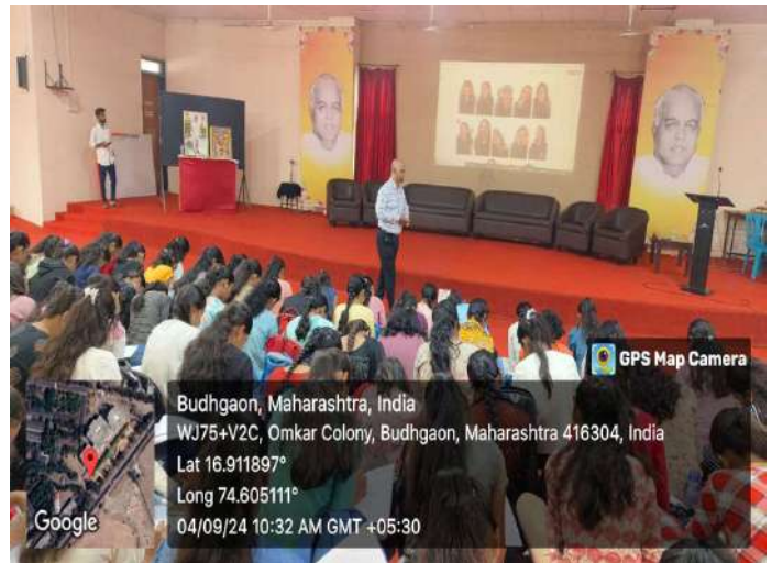
Activities by the students