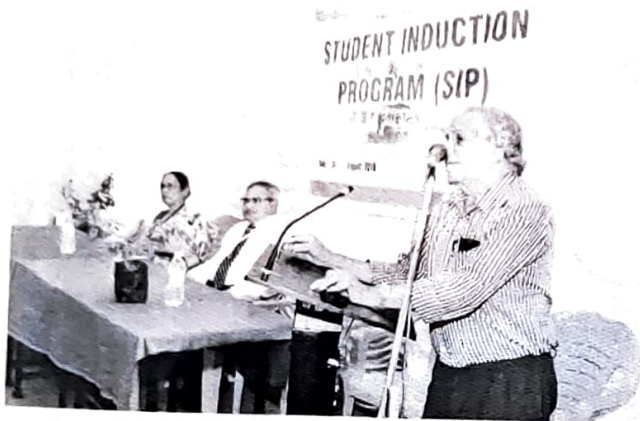
Hon. Vyankatesh Gambhir delivering a speech